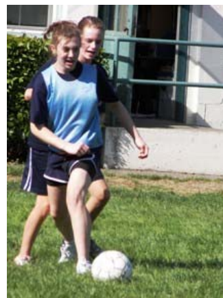
"I've got it... I've got it..."